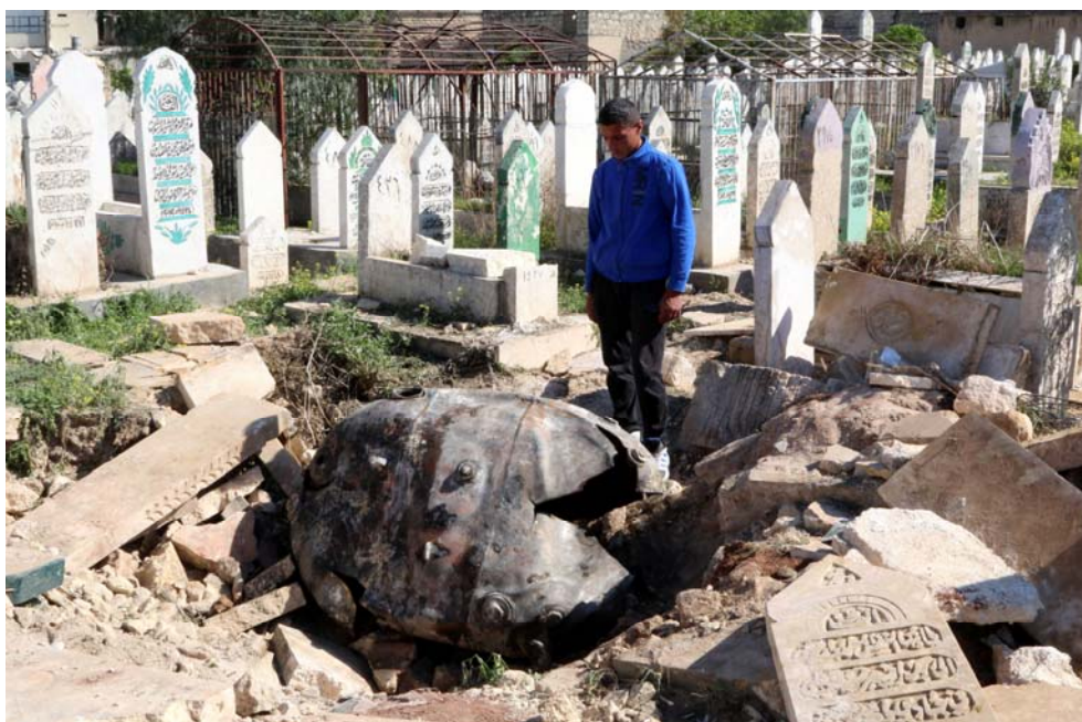
A man looks down at an unexploded barrel bomb dropped by forces loyal to Syria's President Bashar al-Assad at a cemetery in the al-Qatanah neighbourhood of Aleppo. 27 March 2014

According to the Syrian Network for Human Rights, 12,194 people were killed in Syria from 2012 until February 2015 as a result of barrel bomb attacks by government forces. Only 473 of these people were fighters, meaning that 96% of this total were civilians. More than half were killed after the adoption of UN Security Council Resolution 2139. As of February 2015, of all governorates in Syria, Aleppo suffered the greatest number of victims from barrel bomb attacks. According to the Violations Documentation Center, 3,124 civilians – and only 35 fighters – were killed in barrel bomb attacks from January 2014 to March 2015 in Aleppo governorate. Local monitors told Amnesty International that the large number of civilian casualties is likely due to the fact that barrel bombs are so imprecise that the government rarely drops them near the front line, where they might hit their own forces. Instead, barrel bombs have struck apartment buildings and populated areas such as public markets, transportation hubs and mosques.