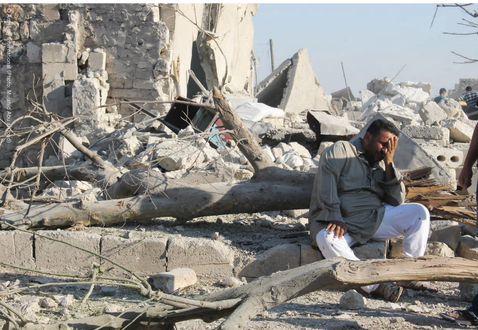
Survivor of an air strike on Ma'adi neighbourhood, 11 July 2014.