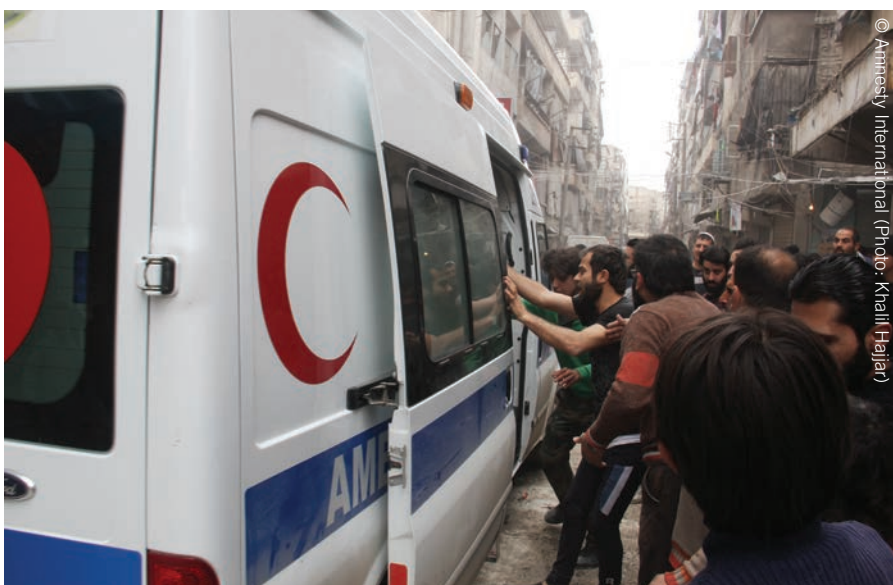
© Amnesty International (Photo: Khalil Hajjar)